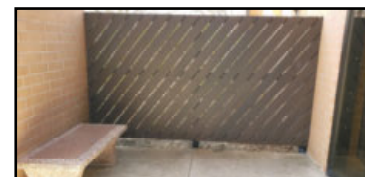
Panels will block wind and reduce debris accumulation.